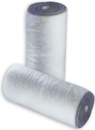
Figure 1: Aquatrex filters