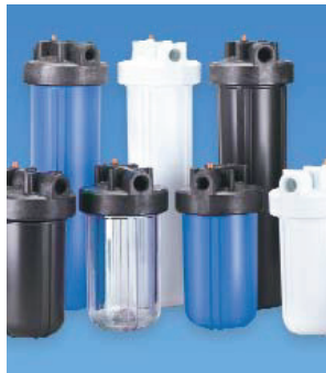
Full-Flow (B-B) 5000 & 10000 series.