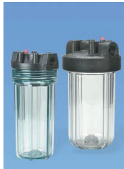
Clear housings To know when cartridge replacement is necessary.