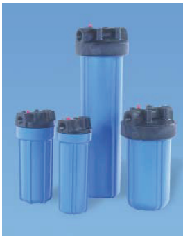
Residential & Commercial 4200, 7000, 4500, 8000 series.

We offer a complete line of under counter filter housings for virtually every application where single cartridge housings are typically used. Select from standard, heavy duty, full-flow, high purity, high temp and valve-in-head models.