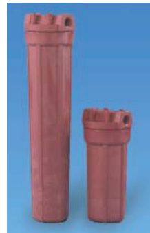
High-Temp For 200°F (93°C).