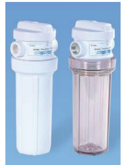
Valve-In-Head Three function valve with shut-off in clear or opaque.